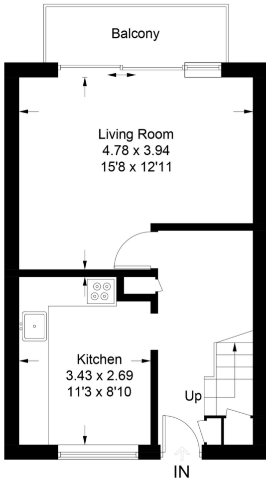
Ground Floor Sq ft 395