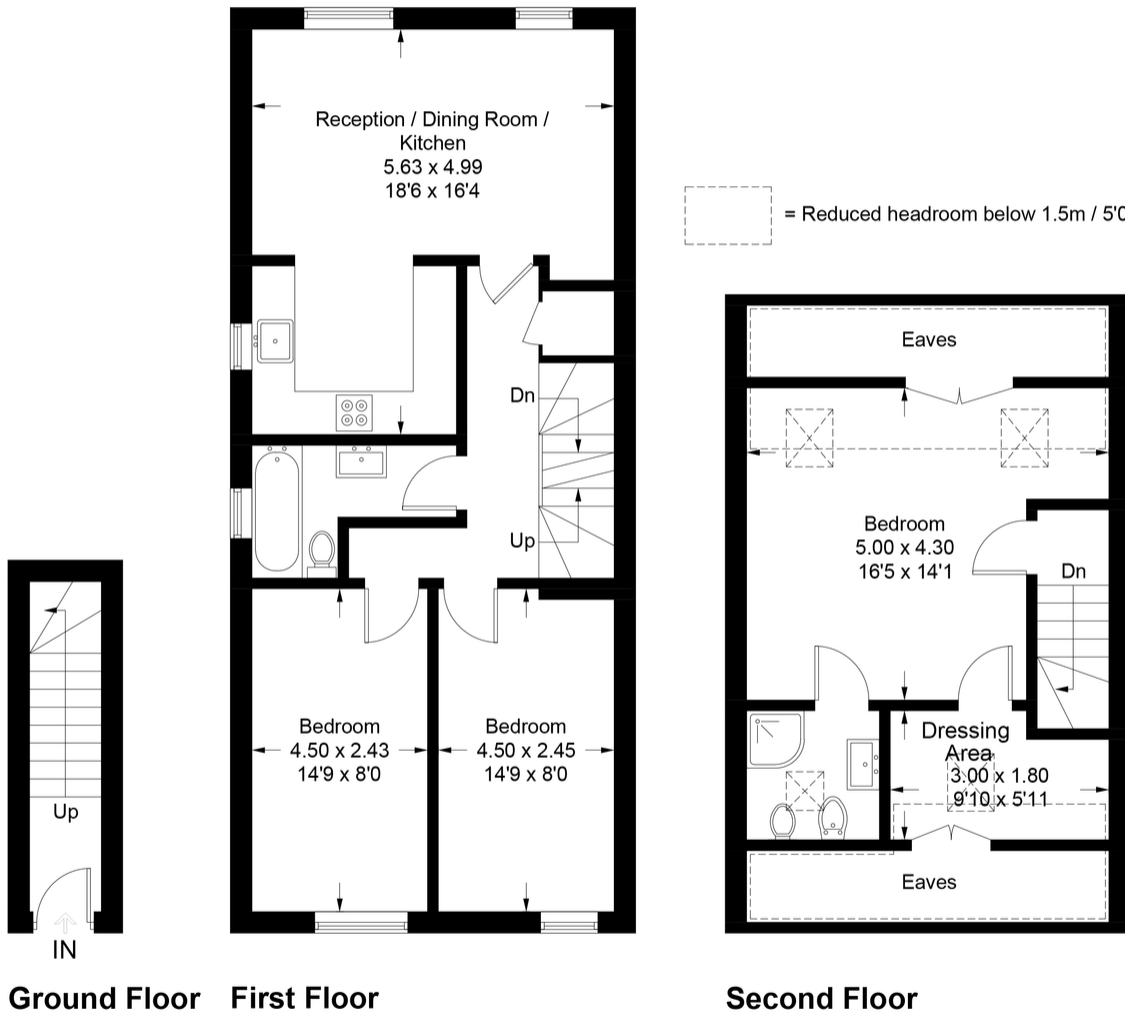
Ground Floor First Floor