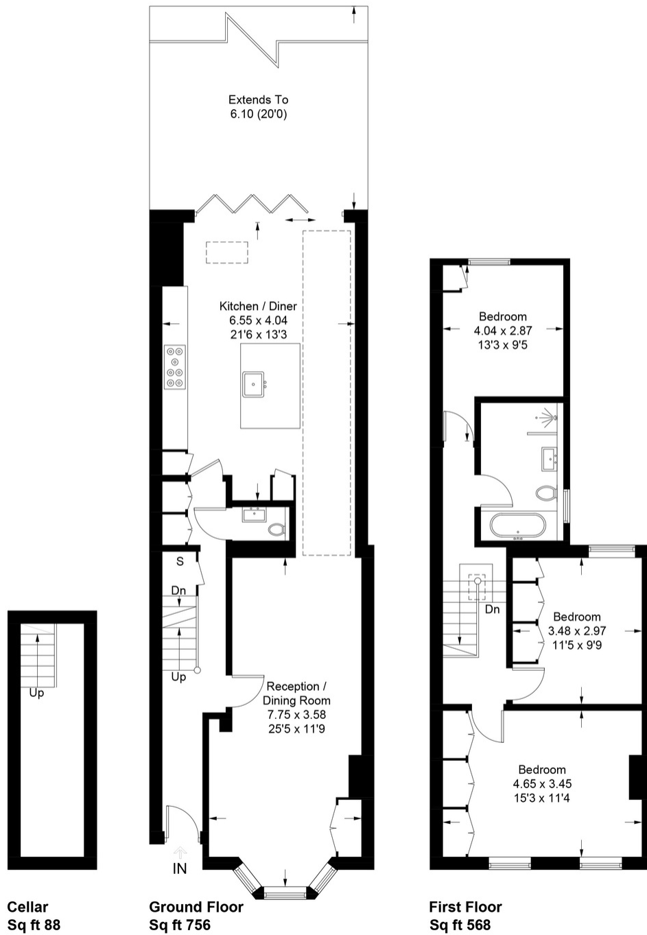
Illustration for identification purposes only, measurements are approximate, not to scale. FloorplansUsketch.com © 2021 (ID783051)