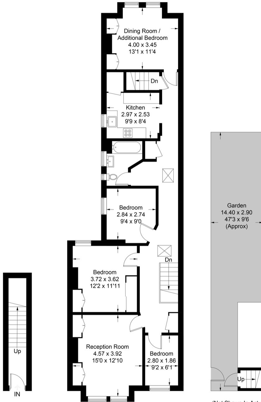
Ground Floor First Floor

(Not Shown In Actual Location /Orientation)